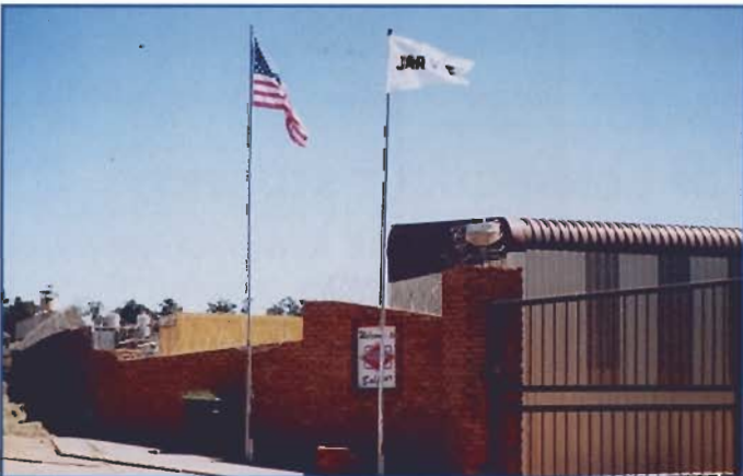
The Jarvis and American flags being flown at the Karan Beef Company. The American flag was flown in honor of Mr. Volpe's January 2000 visit.

Noted for its exceptionally good operation and efficient processing areas, the Karan Beef Company, in Belfour, Republic of South Africa, is probably one of the country's most progressive, modern and outstanding meat processing plants. Karan also owns a feedlot handling 70,000 heads of cattle. The company's future plans include building a state-of-the-art fabrication room, and shortly seeking EC (European Common Market) approval for its kill floor.